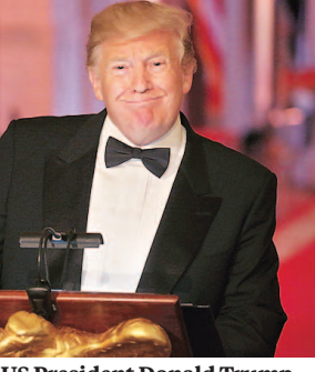
US President Donald Trump at the White House Historical Association Dinner at the White House on Wednesday

However, the plan faces an uphill task mainly because of the