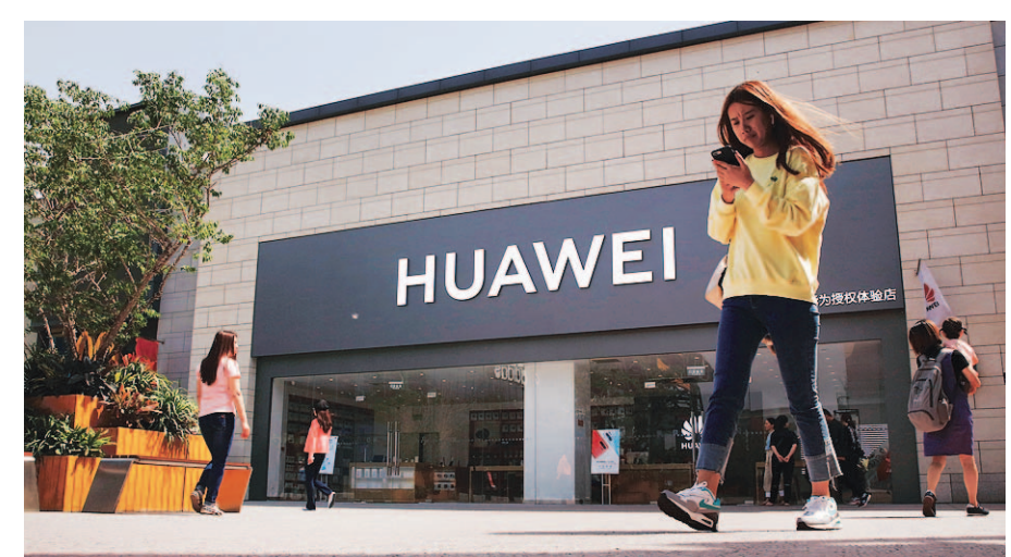
While the order did not specifically name any country or company, US officials have previously

While the order did not specifically name any country or company, US officials have previously labelled Huawei a 'threat" and lobbied allies not to use Huawei network equipment in next-generation 5G networks. Speaking at a US Senate Appropriations subcommittee