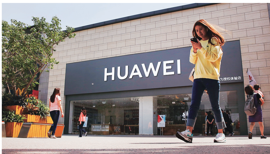
While the order did not specifically name any country or company, US officials have previously labelled Huawei a 'threat'

While the order did not specifically name any country or company, US officials have previously labelled Huawei a "threat" and lobbied allies not to use Huawei network equipment in next-generation 5G networks. Speaking at a US Senate Appropriations subcommittee