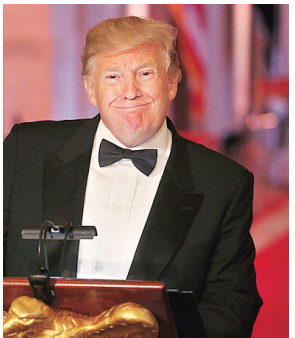
US President Donald Trump at the White House Historical Association Dinner at the White House on Wednesday

However, the plan faces an uphill task mainly because of the